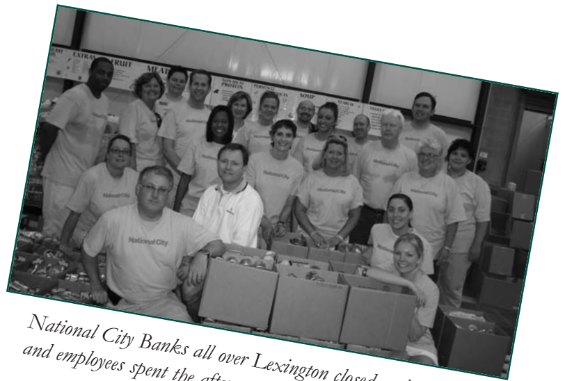
National City Banks all over Lexington closed early on July 16 and employees spent the afternoon volunteering in the community.