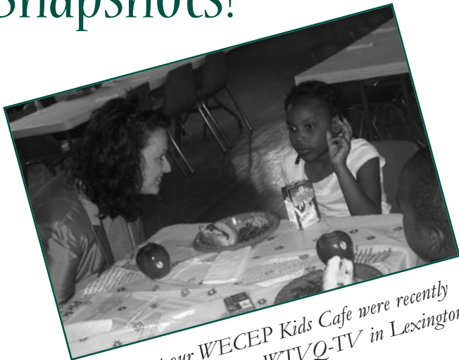
Kids at our WECEP Kids Cafe were recently featured in a story by WTVQ-TV in Lexington.