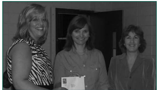
God's Pantry Food Bank received a $10,000 grant from the Jackson Curlin for Kids Fund in June. It will benefit the food bank's Kids Cafe programs.