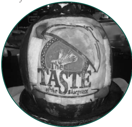
This year's Taste of the Bluegrass was a huge success, raising more than $114,000.