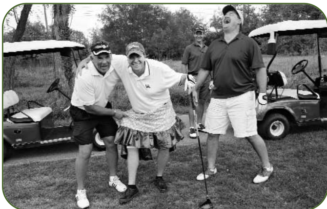
This group of golfers had a blast at the skirt hole during the 2010 Golf Fore the Hungry event at the University Club of Kentucky on August 30.