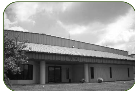
Our new Winchester warehouse