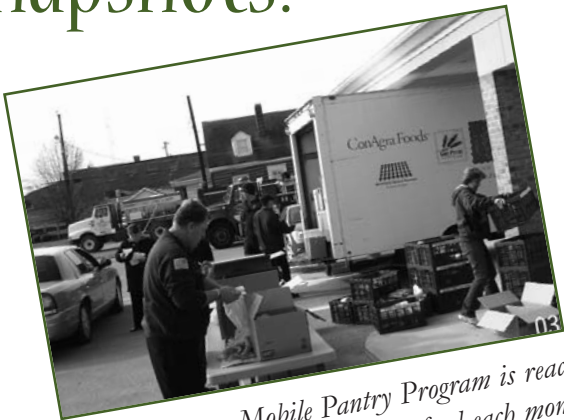
This year our Mobile Pantry Program is reaching out to Harrison County with food each month.