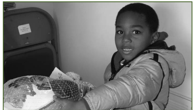
God's Pantry Food Bank distributed nearly 4,000 food boxes and frozen turkeys to Fayette County families in need through the Sharing Thanksgiving program. Here is one very happy recipient.