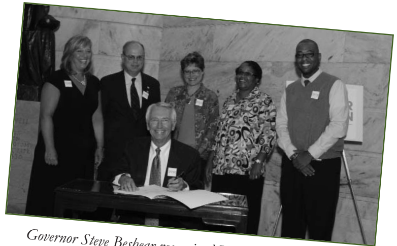
Governor Steve Beshear recognized Hunger Action Month at a ceremony in the capitol rotunda in September.